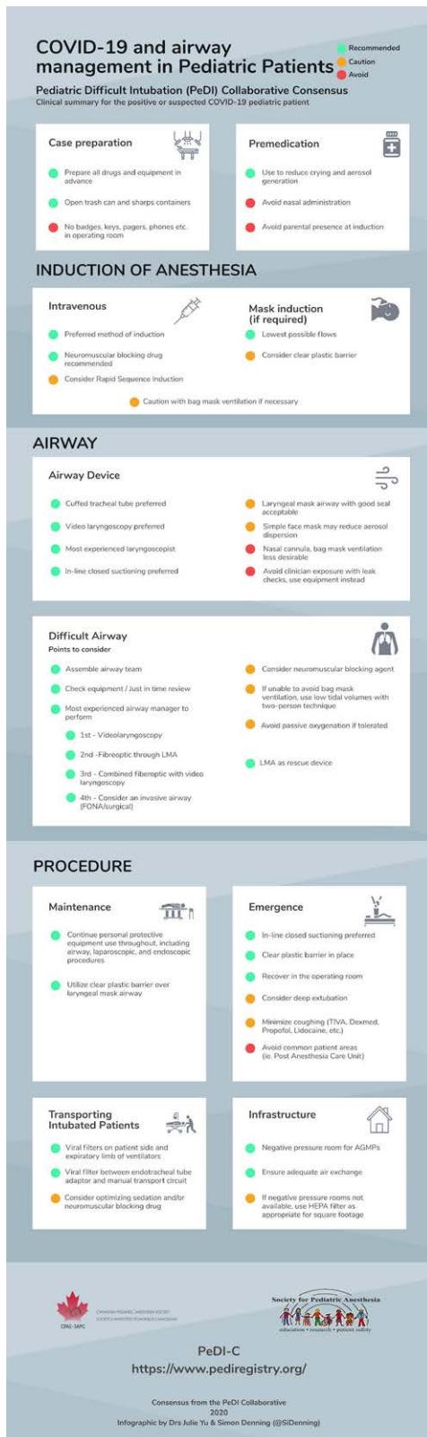
Figure 1. A cognitive aid summarizing the recommendations of PeDI-C for airway management of pediatric patients during the COVID-19 pandemic. AGMP indicates aerosol-generating medical procedure; COVID-19, coronavirus disease 2019; FONA, front of neck access; HEPA, high-efficiency particulate air; LM, laryngeal mask; PeDI-C, Pediatric Difficult Intubation Collaborative; TIVA, total intravenous anesthesia.

agreed that IV induction is preferred. However, clinicians should assess the child’s disposition to IV catheter placement as struggling to place a catheter may result in higher exposure to respiratory droplets if the child cries. PeDI-C recommended rapid sequence induction or modified rapid sequence to reduce the risk of reflex airway activation during intubation with associated aerosolization. Rapid Sequence Induction may not be feasible without severe hypoxemia in small children and patients with severe lung pathology. These patients should receive gentle positive pressure ventilation with the goal of using just enough tidal volume to achieve chest rise while maintaining a tight mask seal.