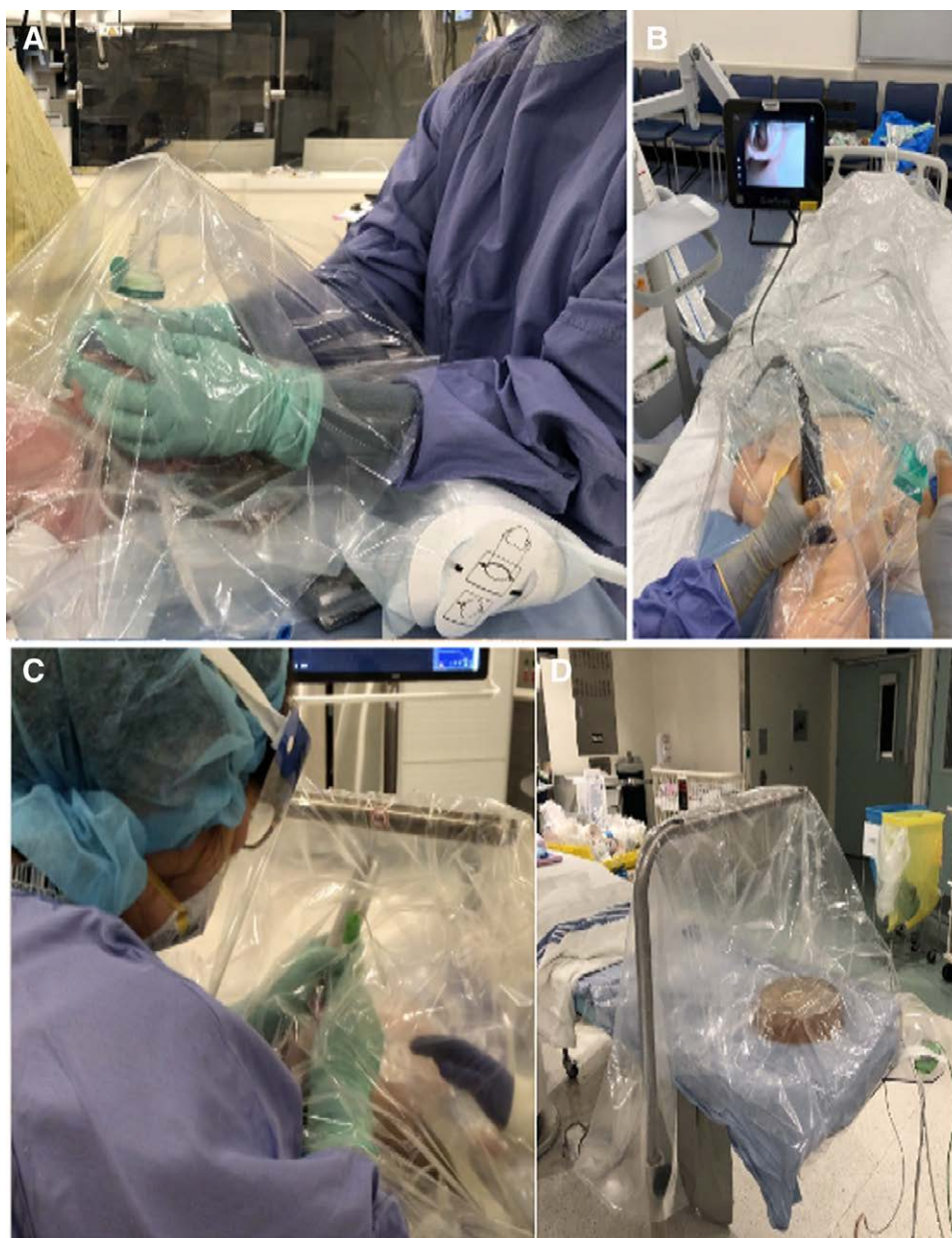
Figure 2. A depiction of transparent drapes being used as an aerosolization barrier during mask induction in a patient (A); video laryngoscopy intubation in a manikin (B); direct laryngoscopy in a real patient (C); and 3-drape technique using an anesthesia elbow and suction under the transparent drapes (D).

desirable approaches were high- or low-flow nasal cannula or bag-mask ventilation, though these techniques may be unavoidable at times. A simple oxygen mask placed on top of a nasal cannula may reduce the risk of aerosol dispersion (Supplemental Digital Content 3, Video 2, http://links.lww.com/AA/D86 ). PeDI-C recommended avoiding techniques that bring the clinician's face or stethoscope near the patient to verify leak pressures for endotracheal tube (ETT) and supraglottic airway (SGA). Clinicians can use the ventilator's measurements of expired and inspired tidal volume and handheld manometers to titrate cuff inflation. Wireless stethoscopes and point-of-care ultrasound can be used to confirm bilateral ventilation of the lungs. A "high-quality" viral filter should be placed between the breathing circuit and